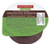
00050 - Kozy Shack® Simply Well® No Sugar Added Chocolate Pudding