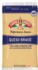
48192 - Queso Bravo® Cheese Dip, Yellow