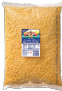
42049 - Extra Melt® Shredded Process American Cheese, Yellow