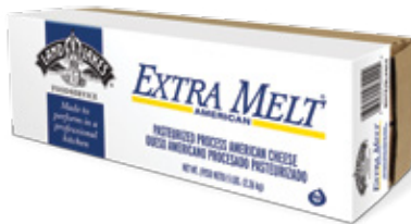
48153 - Extra Melt® American Cheese, Yellow