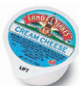
44850 - LAND O LAKES® Cream Cheese Cups, 100/1oz Portions