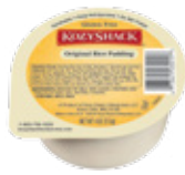
03015 - Kozy Shack® Rice Pudding