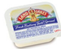
19714 - Fresh Buttery Taste® Spread, 460/14g Cups