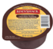
03135 - Kozy Shack® Chocolate Pudding