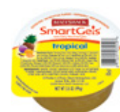
03250 - Kozy Shack® Tropical SmartGels® Naturally Flavored Gels

Water, Sugar, Contains Less Than 2% of Fruit and Vegetable Juice Concentrates (color), Natural Flavor, Citric Acid, Carrageenan, Locust Bean Gum, Potassium Citrate, Fumaric Acid.