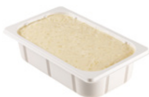
73000 - Kozy Shack® Tapioca Pudding, Bulk