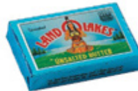
17470 - LAND O LAKES® Butter Continentals, Unsalted, 800/7.6g