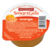
03220 - Kozy Shack® Orange SmartGels® Naturally Flavored Gels