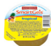
03380 - Kozy Shack® Sugar Free Tropical SmartGels® Naturally Flavored Gels

Phenylketonurics: Contains Phenylalanine