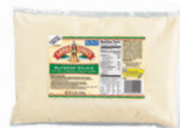
39453 - Alfredo Sauce