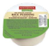
00052 - Kozy Shack® Simply Well® No Sugar Added Rice Pudding