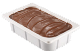
73010 - Kozy Shack® Chocolate Pudding, Bulk