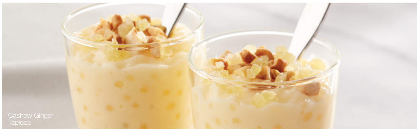
Cashew Ginger Tapioca

For more serving suggestions, visit landolakesfoodservice.com