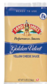
48297 - Golden Velvet™ Yellow Cheese Sauce