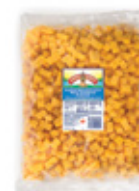
44751 - LAND O LAKES® RF Mild Cheddar Cheese Cubes, Bulk