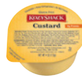
03155 - Kozy Shack® Custard, 4oz