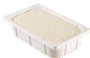
73055 - Kozy Shack® Rice Pudding, Bulk