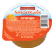
03360 - Kozy Shack® Sugar Free Orange SmartGels® Naturally Flavored Gels