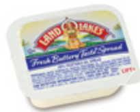
19705 - Fresh Buttery Taste® Spread, 912/5g Cups