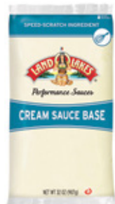
15782 - LAND O LAKES® Cream Sauce Base