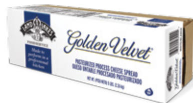
48775 - Golden Velvet® Cheese Spread, Yellow