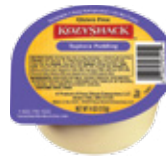
03125 - Kozy Shack® Tapioca, 4oz