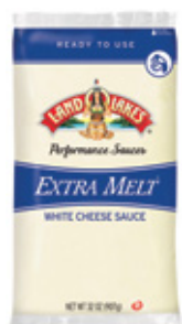
39050 - Extra Melt™ White Cheese Sauce