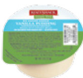
00049 - Kozy Shack® Simply Well® No Sugar Added Vanilla Pudding