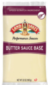
15783 - LAND O LAKES® Butter Sauce Base