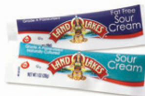
64407 - LAND O LAKES® Fat Free Sour Cream, 100/1oz Portions