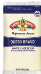
48238 - Queso Bravo® Cheese Dip, White