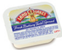
19711 - Fresh Buttery Taste® Spread, 460/10g Cups