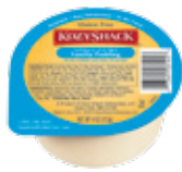
03145 - Kozy Shack® Vanilla Pudding