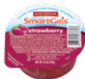
03370 - Kozy Shack® Sugar Free Strawberry SmartGels® Naturally Flavored Gels

Phenylketonurics: Contains Phenylalanine