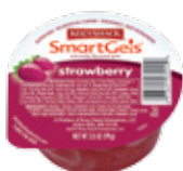
03240 - Kozy Shack® Strawberry SmartGels® Naturally Flavored Gels

Water, Sugar, Contains Less Than 2% of Natural Flavor, Carrageenan, Locust Bean Gum, Potassium Citrate, Citric Acid, Beta Carotene and Fruit and Vegetable Juice Concentrates (color), Fumaric Acid.