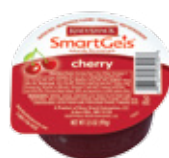
03200 - Kozy Shack® Cherry SmartGels® Naturally Flavored Gels

Water, Sugar, Contains Less Than 2% of Natural Flavor, Carrageenan, Locust Bean Gum, Potassium Citrate, Citric Acid, Fruit and Vegetable Juice Concentrates (color), Fumaric Acid.