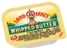
19145 - LAND O LAKES® Whipped But-R-Cups® Butter, Salted, 450/10g Cups