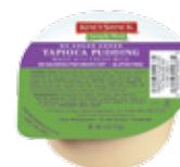
00051 - Kozy Shack® Simply Well® No Sugar Added Tapioca Pudding