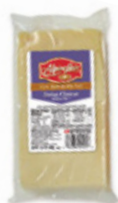
00401 - Alpine Lace® RF Read-Pac Swiss Slices